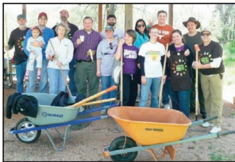
Some of the volunteers who worked at Schroeter Park on It's My Park Day 2012