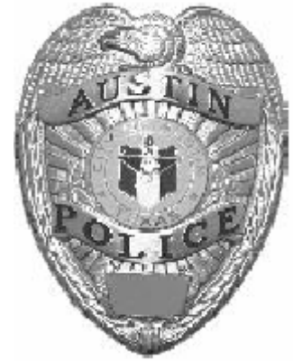
Please join us on March 28th to show your appreciation for Austin's finest.