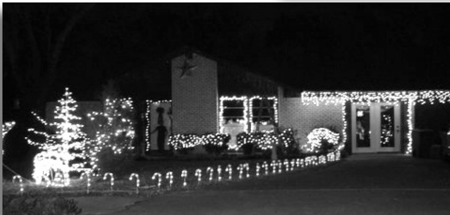
2nd Place (left): 11501 Elk Park Circle Very colorful and fun! The clincher: Santa standing in the the window and a window view of the snowy village!