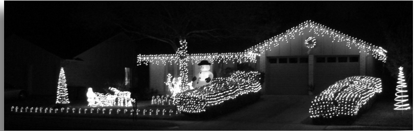
1st Place (above): 11702 Santa Cruz Flawless Decorations! Lots of light complete with an Angel and reindeer.

We had some beautifully decorated houses in the neighborhood this Holiday season. Congratulations to our winners!