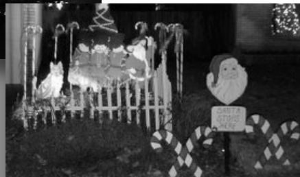
3rd Place tie (left): 4711 Gray Fox

Beautiful white manger scene, lots of clean white lights and an extra bonus, a "Santa Stop" for him to park his sleigh.