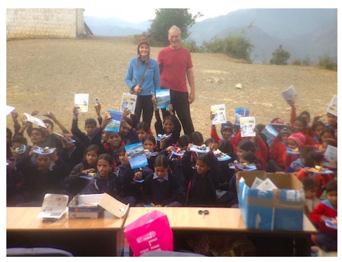
Children express their appreciation

We all enjoyed the afternoon. Afterward, the older children sang a Garhwali folk song and performed a traditional dance for us. All the children were so well behaved.