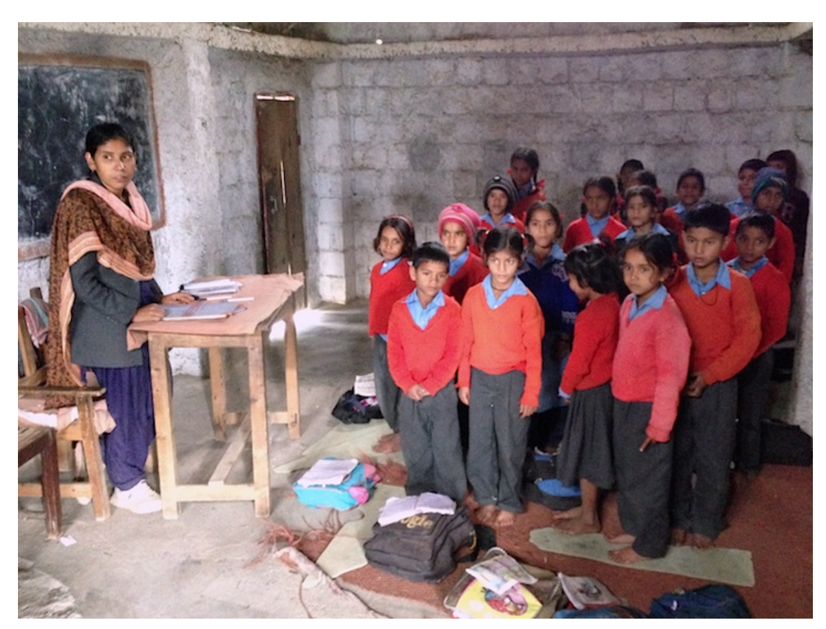
The teachers and kids were a little shocked.