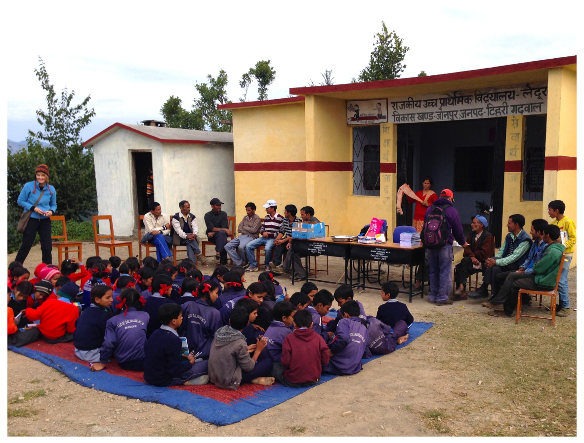
Children gather to receive school supplies

The principal of the school introduced us and I told everyone in Hindi that people from two villages in America had sent the supplies for the village. Everyone clapped. Then we started handing out the school supplies and treats to the children.