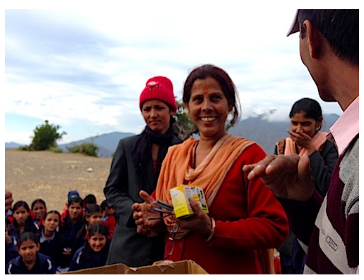
The teachers were so happy to have new supplies