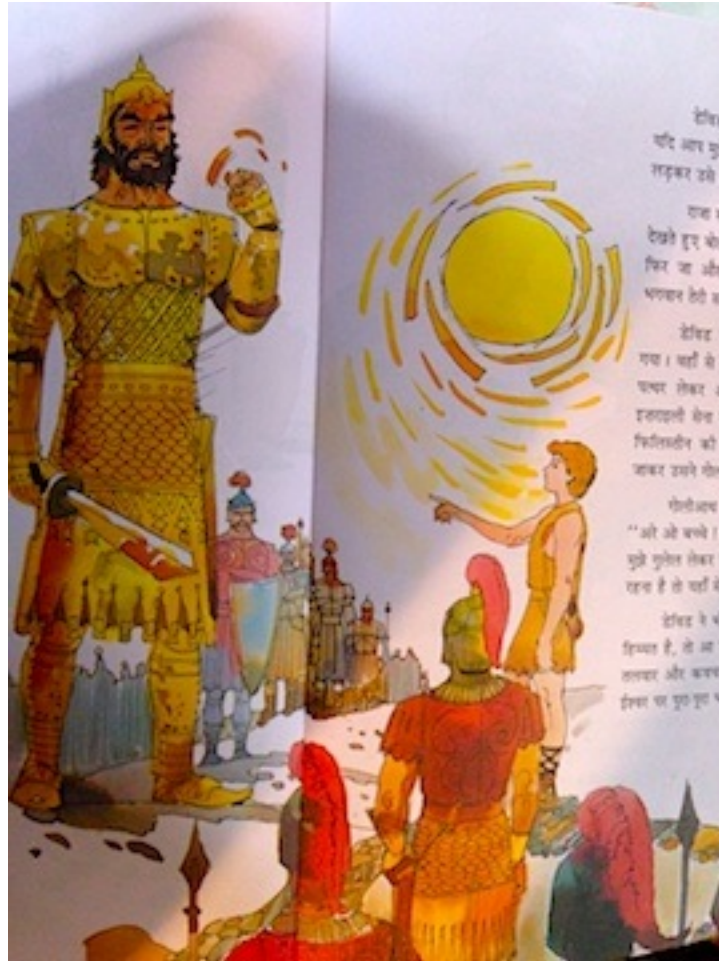
David and Goliath story book