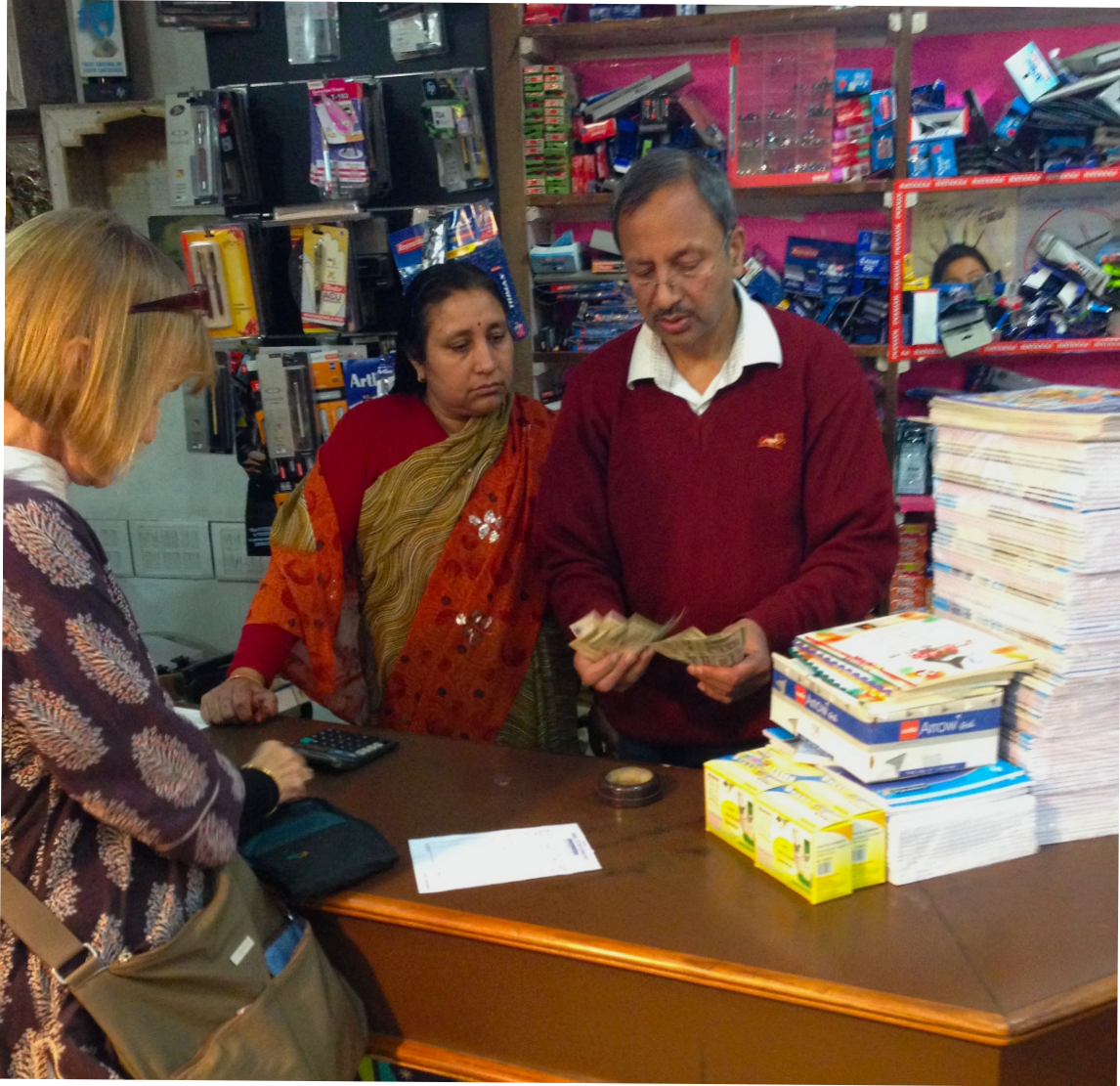
At the Ram Saran Dass Stationers purchasing the stack of school supplies on the right

After learning what the Pahari village needed, John and I got busy shopping. We bought 100 packages of cookies, 5 large bags of candies, 100 notebooks, 100 pens, 50 pencils, boxes of colored chalks for the teachers, and a pile of illustrated story books in Hindi for the village school, including Tom Sawyer ,