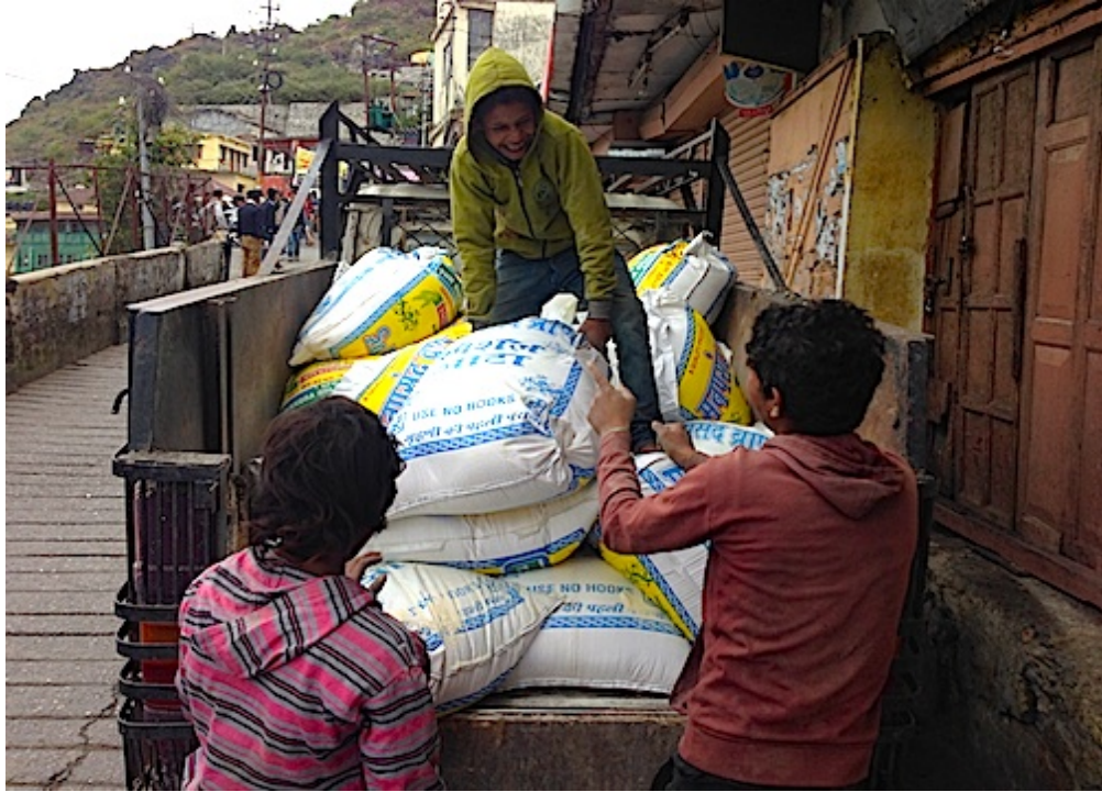
Flour purchased for the village

We found a small truck to take the flour and had the bags loaded. Then we headed up the hill to Lal Tibba, stopping to pick up the other packages of school supplies and treats.