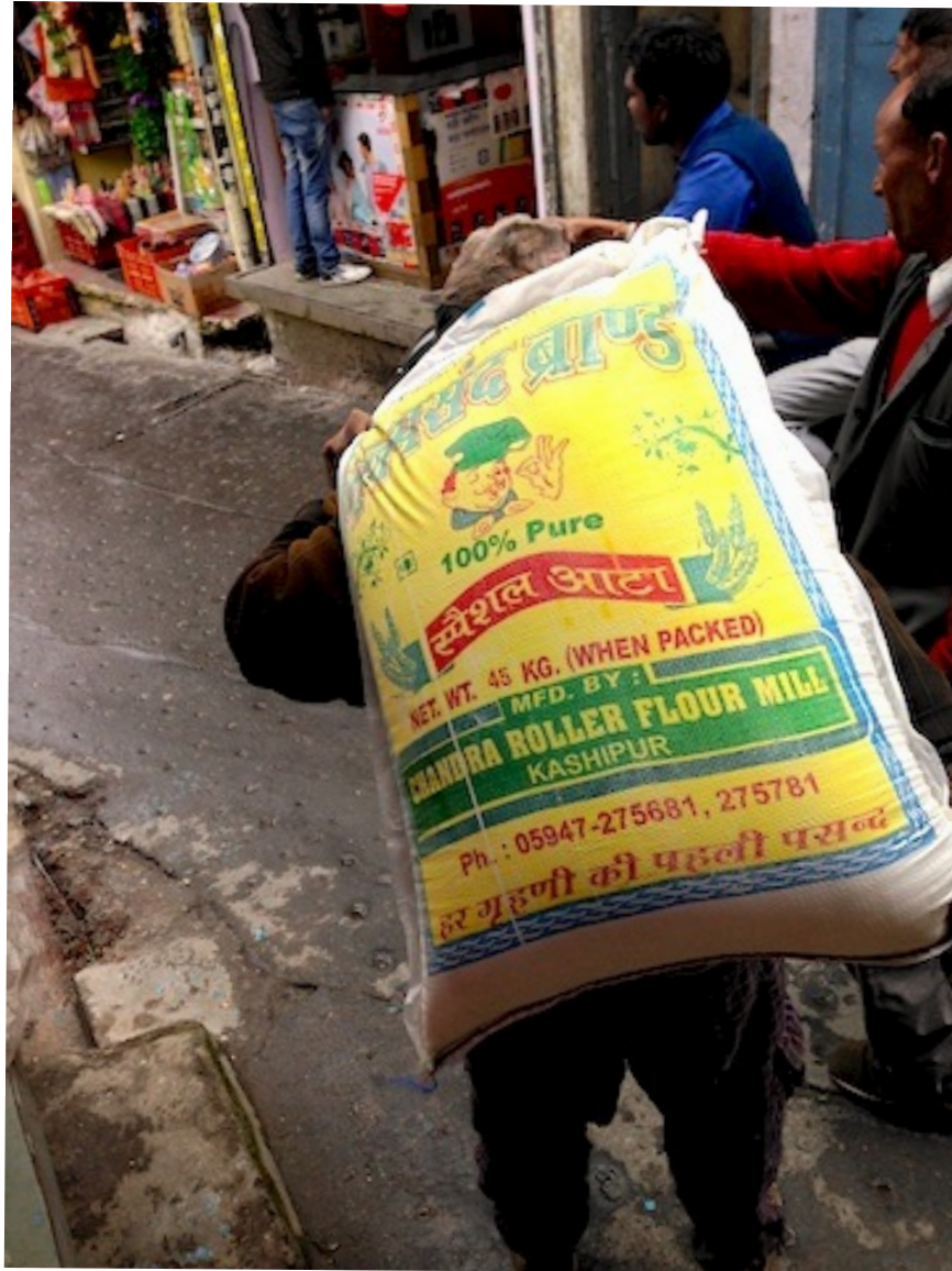
Loading flour into jeep

The Paharis knew the prices and quality of the flour and advised us against the higher prices even though they were not paying.