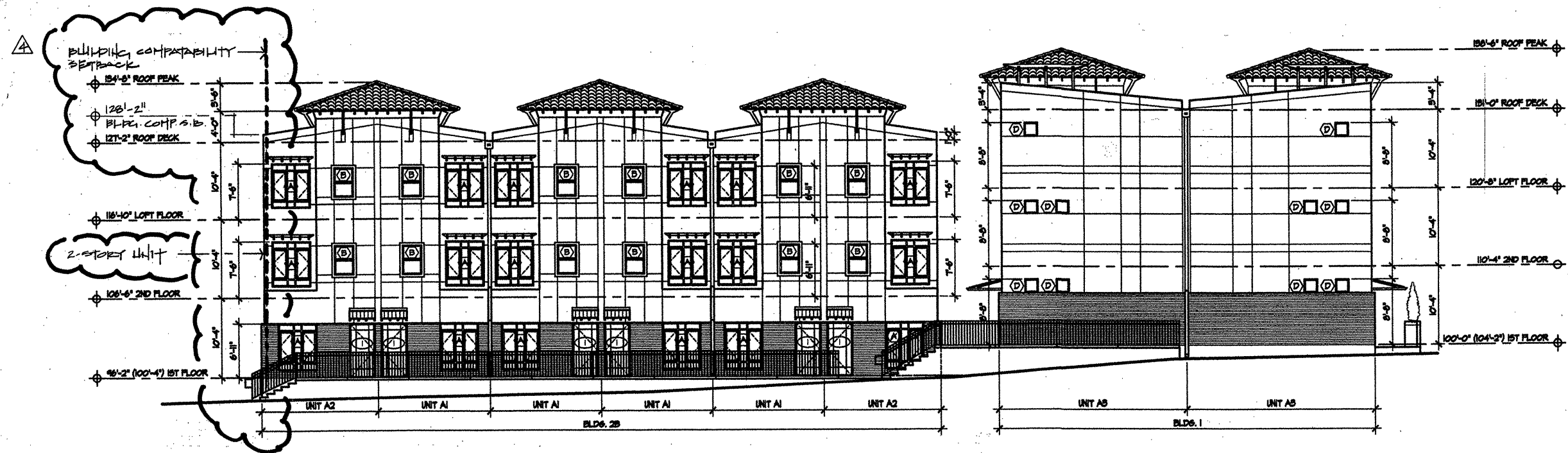
1 WEST ELEVATION - BLDGS. 2B & 1 SCALE: 1/8"=1'-0"