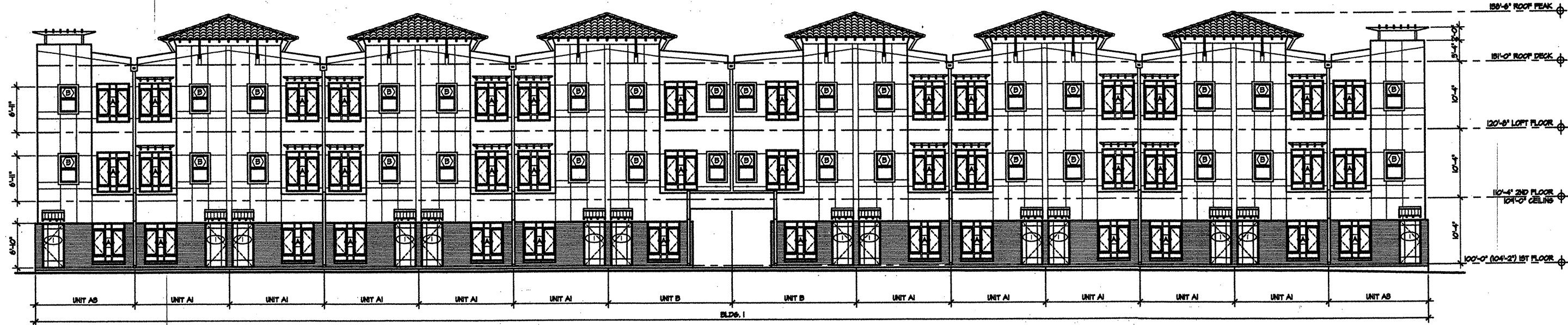
2 NORTH ELEVATION - BLDG. 1 SCALE: 1/8"=1'-0"